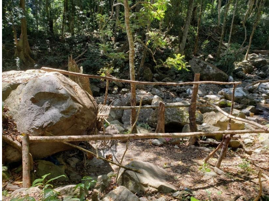
Fig 4. Used camps by hunter found during the surveying time.