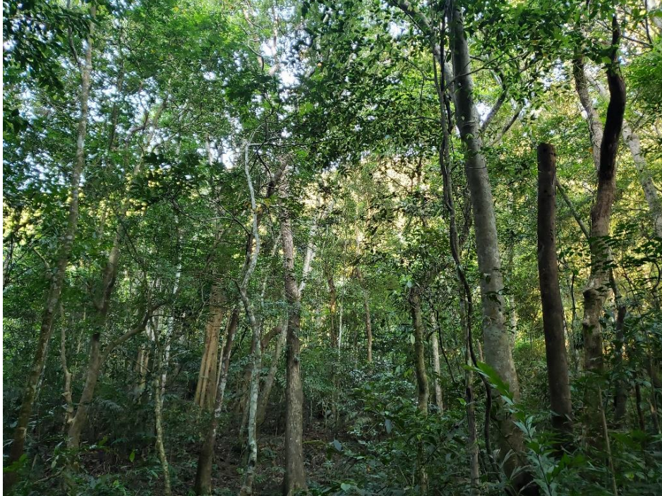
Fig 2. Habitat of the gibbon in Kon Ka Kinh NP