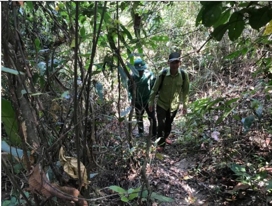
Fig 3. Forest guards on the way to forest patrol