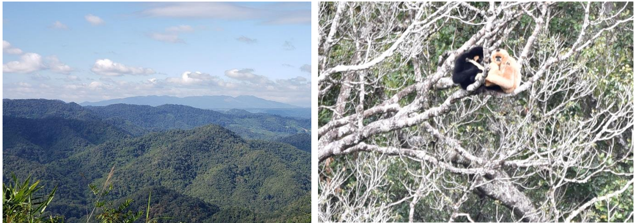
Fig 1: Gibbons in the Kon Ka Kinh National Park

Updating Project Activity from January to April 2021